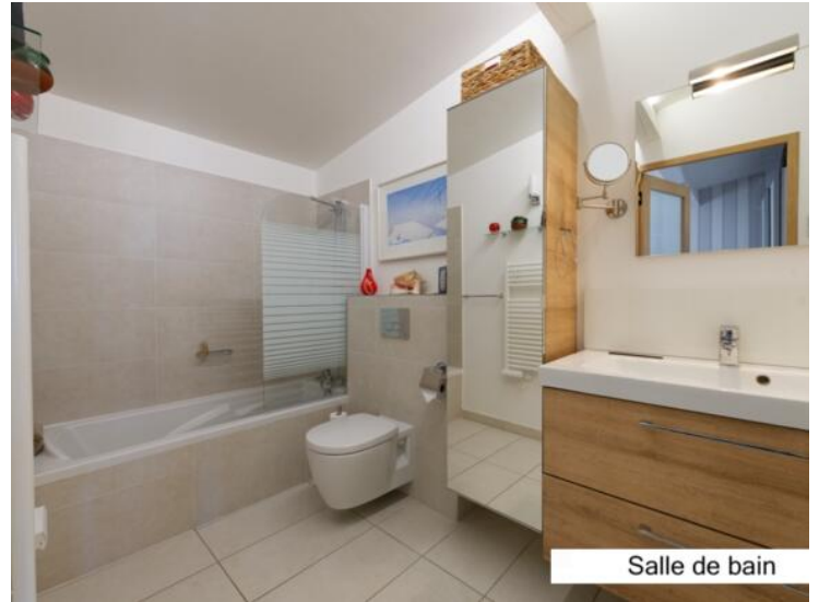
Salle de bain