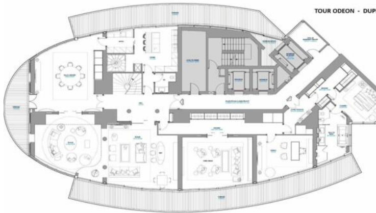
TOUR ODEON - DUPL