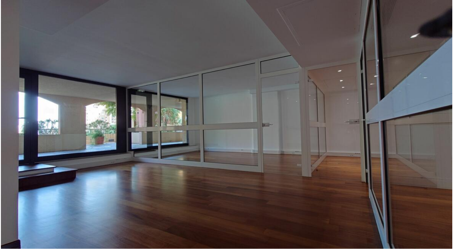
Résidence « Le Raphael » Bureaux n° 725-7520