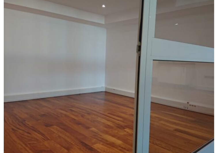
Résidence « Raphael » Bureaux n° 725-7250